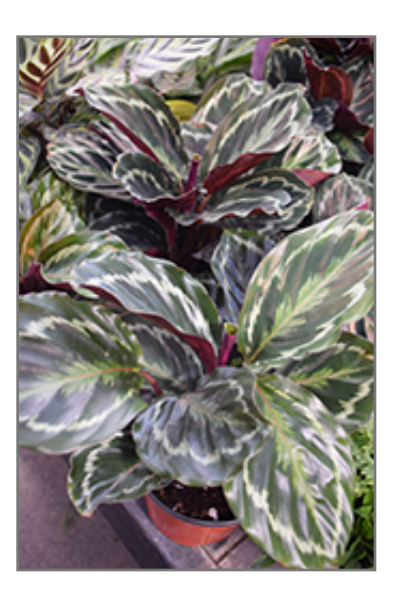
Medallion Calathea foliage

When grown indoors, Medallion Calathea can be expected to grow to be about 30 inches tall at maturity, with a spread of 24 inches. It grows at a slow rate, and under ideal conditions can be expected to live for approximately 5 years. This houseplant performs well in both bright or indirect sunlight and strong artificial light, and can therefore be situated in almost any well-lit room or location. It does best in average to evenly moist soil, but will not tolerate standing water. The surface of the soil shouldn't be allowed to dry out completely, and so you should expect to water this plant once and possibly even twice each week. Be aware that your particular watering schedule may vary depending on its location in the room, the pot size, plant size and other conditions; if in doubt, ask one of our experts in the store for advice. It will benefit from a regular feeding with a general-purpose fertilizer with every second or third watering. It is not particular as to soil pH, but grows best in rich soil. Contact the store for specific recommendations on pre-mixed potting soil for this plant.