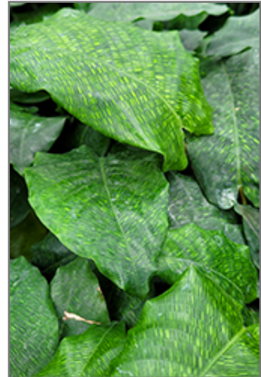
Network Calathea foliage