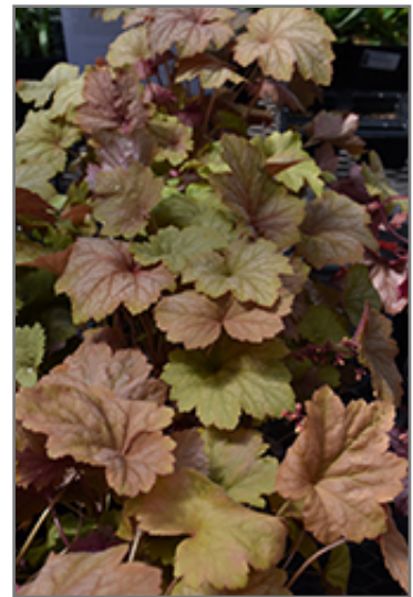
Big Top Caramel Apple Coral Bells foliage