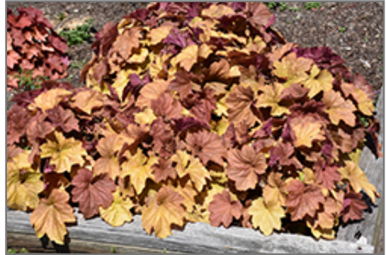
Big Top Caramel Apple Coral Bells

Big Top Caramel Apple Coral Bells is recommended for the following landscape applications;