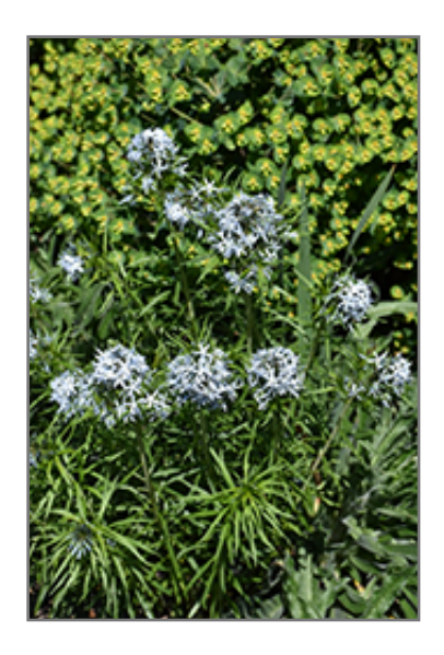
Butterscotch Blue Star flowers

Butterscotch Blue Star will grow to be about 30 inches tall at maturity, with a spread of 24 inches. Its foliage tends to remain dense right to the ground, not requiring facer plants in front. It grows at a slow rate, and under ideal conditions can be expected to live for approximately 20 years. As an herbaceous perennial, this plant will usually die back to the crown each winter, and will regrow from the base each spring. Be careful not to disturb the crown in late winter when it may not be readily seen!