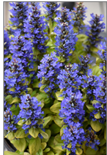
Feathered Friends Petite Parakeet Bugleweed flowers