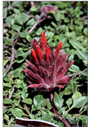
Marian Sampson Scarlet Monardella flowers

Marian Sampson Scarlet Monardella is recommended for the following landscape applications;