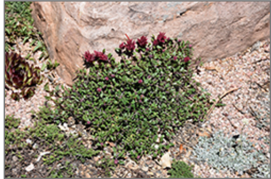
Marian Sampson Scarlet Monardella in bloom

Marian Sampson Scarlet Monardella will grow to be only 3 inches tall at maturity extending to 5 inches tall with the flowers, with a spread of 12 inches. When grown in masses or used as a bedding plant, individual plants should be spaced approximately 8 inches apart. Its foliage tends to remain low and dense right to the ground. It grows at a medium rate, and under ideal conditions can be expected to live for approximately 3 years. As an evergreen perennial, this plant will typically keep its form and foliage year-round.