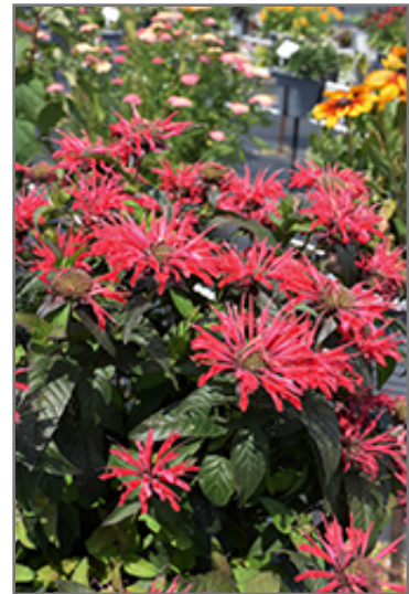
Upscale Red Velvet Beebalm flowers