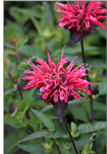
Upscale Red Velvet Beebalm flowers