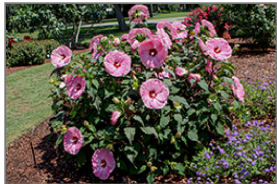
Summerific Spinderella Hibiscus in bloom