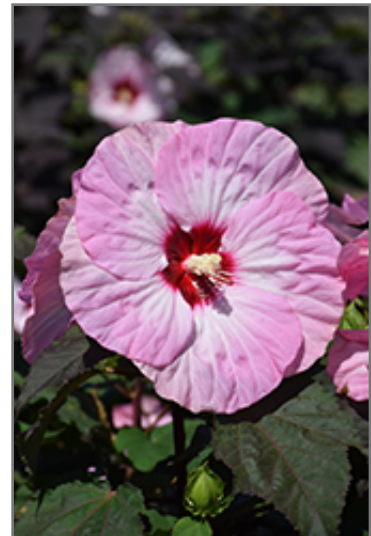
Summerific Spinderella Hibiscus flowers

This plant will require occasional maintenance and upkeep, and is best cleaned up in early spring before it resumes active growth for the season. It is a good choice for attracting butterflies and hummingbirds to your yard. Gardeners should be aware of the following characteristic(s) that may warrant special consideration;