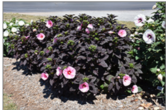
Summerific Edge of Night Hibiscus in bloom