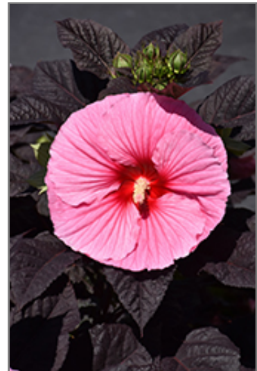
Summerific Edge of Night Hibiscus flowers

Summerific Edge of Night Hibiscus is recommended for the following landscape applications;