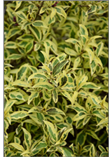
Bubbly Wine Weigela foliage

Bubbly Wine Weigela is recommended for the following landscape applications;