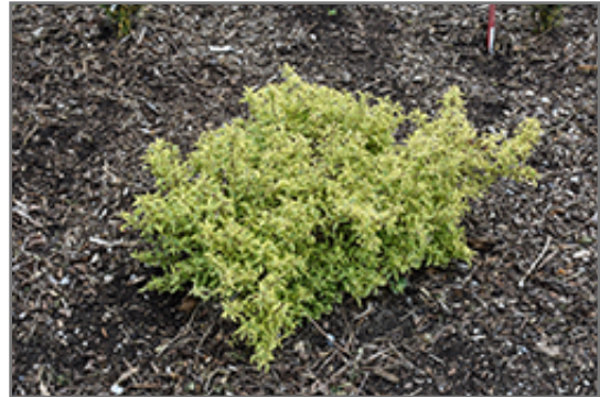
Bubbly Wine Weigela