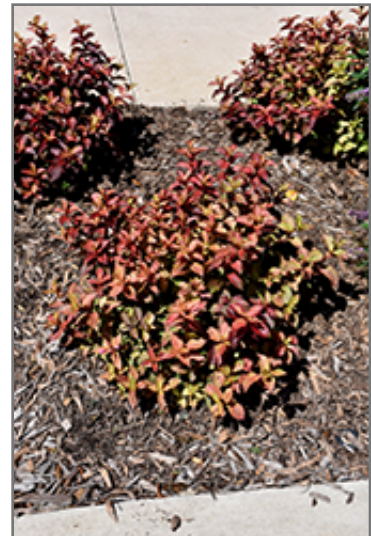
Midnight Sun Reblooming Weigela