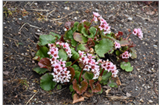
Fairytale Romance Bergenia in bloom