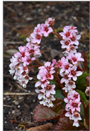
Fairytale Romance Bergenia flowers

Fairytale Romance Bergenia is recommended for the following landscape applications;