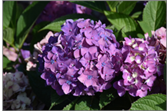
Let's Dance Arriba! Hydrangea flowers

Let's Dance Arriba! Hydrangea makes a fine choice for the outdoor landscape, but it is also well-suited for use in outdoor pots and containers. Because of its height, it is often used as a 'thriller' in the 'spiller-thriller-filler' container combination; plant it near the center of the pot, surrounded by smaller plants and those that spill over the edges. It is even sizeable enough that it can be grown alone in a suitable container. Note that when grown in a container, it may not perform exactly as indicated on the tag - this is to be expected. Also note that when growing plants in outdoor containers and baskets, they may require more frequent waterings than they would in the yard or garden.