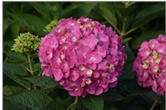
Let's Dance Arriba! Hydrangea flowers

Let's Dance Arriba! Hydrangea is recommended for the following landscape applications;