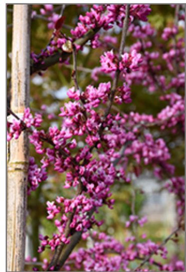
Midnight Express Redbud flowers