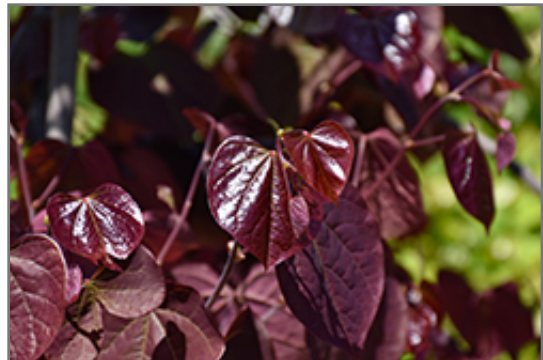
Midnight Express Redbud foliage