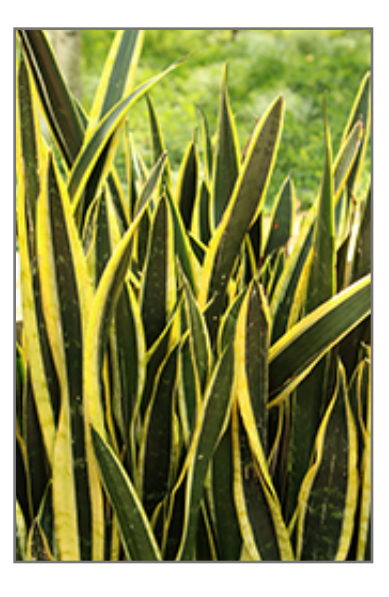
Black Gold Snake Plant foliage

When grown indoors, Black Gold Snake Plant can be expected to grow to be about 3 feet tall at maturity, with a spread of 12 inches. It grows at a slow rate, and under ideal conditions can be expected to live for approximately 10 years. This houseplant performs well in both bright or indirect sunlight and strong artificial light, and can therefore be situated in almost any well-lit room or location. It is very adaptable to both dry and moist soil, but will not tolerate any standing water. The surface of the soil shouldn't be allowed to dry out completely, and so you should expect to water this plant once and possibly even twice each week. Be aware that your particular watering schedule may vary depending on its location in the room, the pot size, plant size and other conditions; if in doubt, ask one of our experts in the store for advice. It will benefit from a regular feeding with a general-purpose fertilizer with every second or third watering. It is not particular as to soil pH, but grows best in sandy soil. Contact the store for specific recommendations on pre-mixed potting soil for this plant.