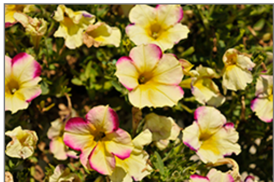
Headliner Banana Cherry Petunia flowers