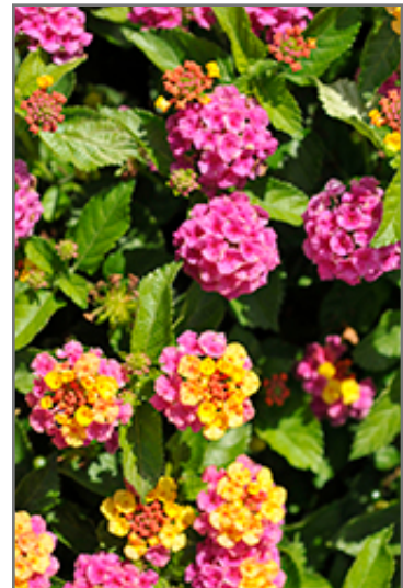
Havana Cherry Lantana flowers