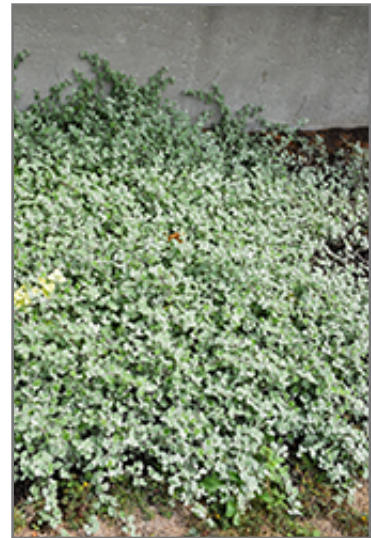
Silver Licorice Plant

Silver Licorice Plant is a fine choice for the garden, but it is also a good selection for planting in outdoor containers and hanging baskets. Because of its trailing habit of growth, it is ideally suited for use as a 'spiller' in the 'spiller-thriller-filler' container combination; plant it near the edges where it can spill gracefully over the pot. Note that when growing plants in outdoor containers and baskets, they may require more frequent waterings than they would in the yard or garden.