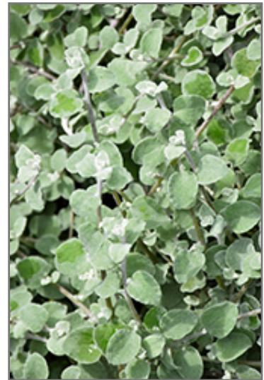
Silver Licorice Plant foliage