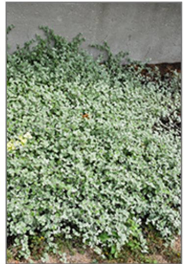
Silver Licorice Plant

Silver Licorice Plant is a fine choice for the garden, but it is also a good selection for planting in outdoor containers and hanging baskets. Because of its trailing habit of growth, it is ideally suited for use as a 'spiller' in the 'spiller-thriller-filler' container combination; plant it near the edges where it can spill gracefully over the pot. Note that when growing plants in outdoor containers and baskets, they may require more frequent waterings than they would in the yard or garden.