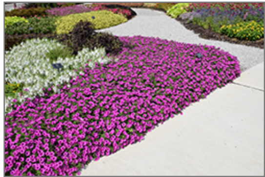
Supertunia Vista Jazzberry Petunia in bloom

Supertunia Vista Jazzberry Petunia will grow to be about 24 inches tall at maturity, with a spread of 3 feet. When grown in masses or used as a bedding plant, individual plants should be spaced approximately 20 inches apart. Its foliage tends to remain dense right to the ground, not requiring facer plants in front. This fast-growing annual will normally live for one full growing season, needing replacement the following year.