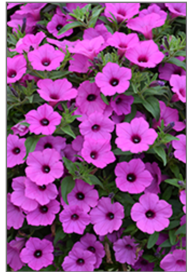
Supertunia Vista Jazzberry Petunia flowers

This plant will require occasional maintenance and upkeep. Trim off the flower heads after they fade and die to encourage more blooms late into the season. It is a good choice for attracting butterflies and hummingbirds to your yard, but is not particularly attractive to deer who tend to leave it alone in favor of tastier treats. It has no significant negative characteristics.