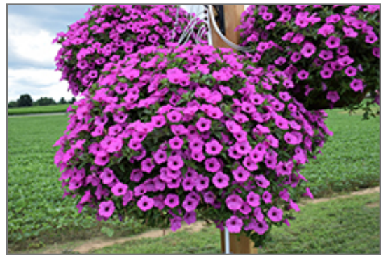
Supertunia Vista Jazzberry Petunia in bloom