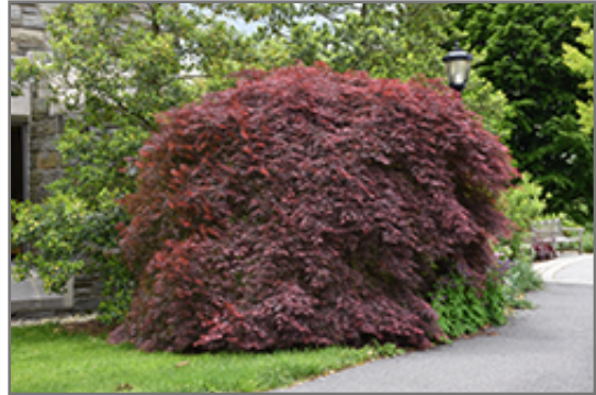
Tamukeyama Japanese Maple

Tamukeyama Japanese Maple will grow to be about 7 feet tall at maturity, with a spread of 10 feet. It tends to be a little leggy, with a typical clearance of 3 feet from the ground, and is suitable for planting under power lines. It grows at a slow rate, and under ideal conditions can be expected to live for 80 years or more.