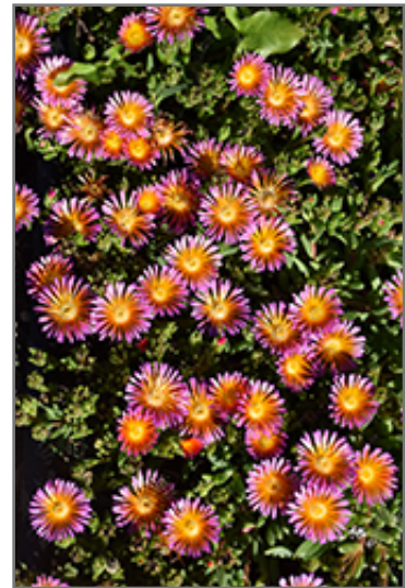
Ocean Sunset Orange Glow Ice Plant flowers

Ocean Sunset Orange Glow Ice Plant will grow to be only 4 inches tall at maturity extending to 6 inches tall with the flowers, with a spread of 12 inches. When grown in masses or used as a bedding plant, individual plants should be spaced approximately 10 inches apart. Its foliage tends to remain low and dense right to the ground. It grows at a fast rate, and under ideal conditions can be expected to live for approximately 5 years. As an evergreen perennial, this plant will typically keep its form and foliage year-round.