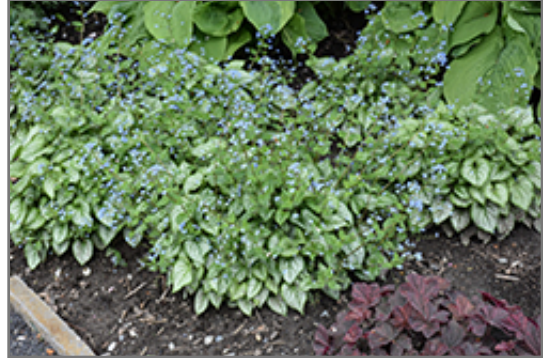
Jack Frost Bugloss in bloom

Jack Frost Bugloss will grow to be about 12 inches tall at maturity extending to 16 inches tall with the flowers, with a spread of 18 inches. When grown in masses or used as a bedding plant, individual plants should be spaced approximately 14 inches apart. It grows at a medium rate, and under ideal conditions can be expected to live for approximately 10 years. As an herbaceous perennial, this plant will usually die back to the crown each winter, and will regrow from the base each spring. Be careful not to disturb the crown in late winter when it may not be readily seen!