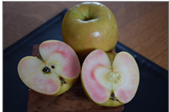
Pink Pearl Apple fruit and flesh

Pink Pearl Apple features showy clusters of lightly-scented white flowers with shell pink overtones along the branches from early to mid spring, which emerge from distinctive red flower buds. It has forest green deciduous foliage. The pointy leaves turn yellow in fall. The fruits are showy chartreuse apples with a rose blush, which are carried in abundance from mid to late summer. The fruit can be messy if allowed to drop on the lawn or walkways, and may require occasional clean-up.