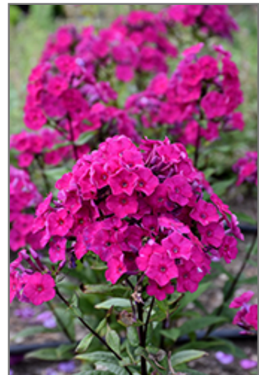
Super Ka-Pow Fuchsia Garden Phlox flowers