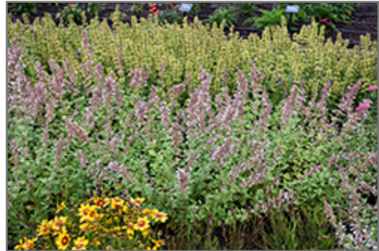
Whispurr Pink Catmint in bloom