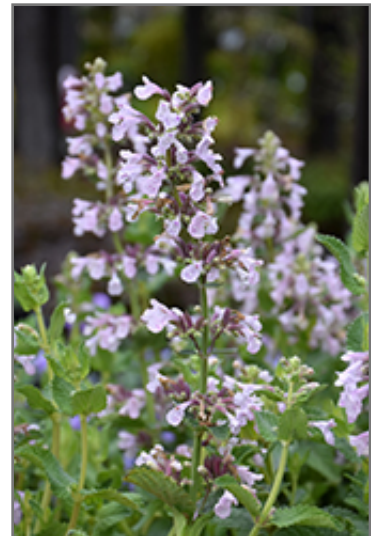
Whispurr Pink Catmint flowers