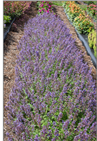
Whispurr Blue Catmint in bloom