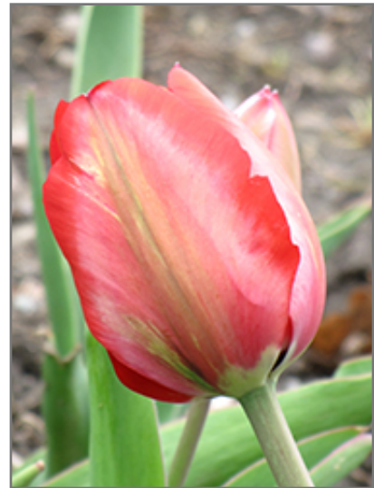
Menton Tulip flowers