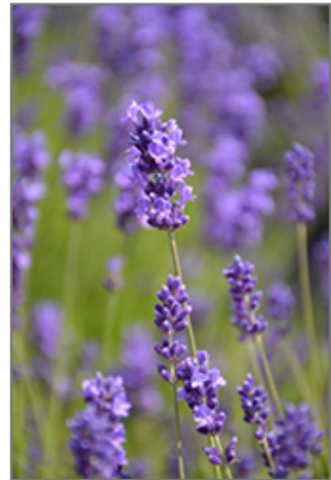
Imperial Gem Lavender flowers

Imperial Gem Lavender is recommended for the following landscape applications;