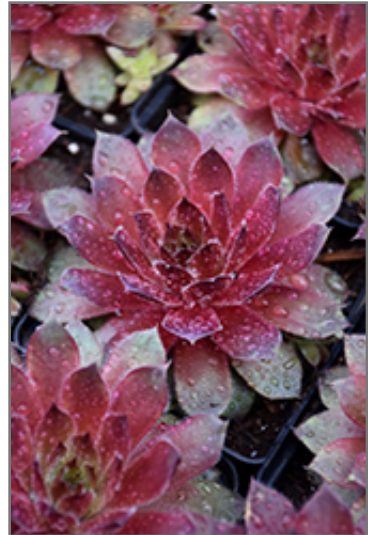
More Honey Hens And Chicks