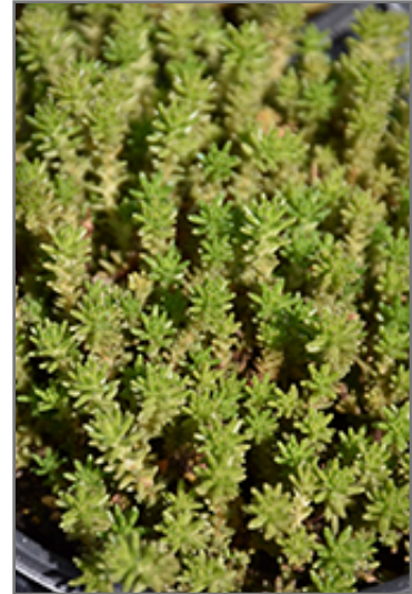
Six Row Stonecrop foliage

Six Row Stonecrop is a fine choice for the garden, but it is also a good selection for planting in outdoor pots and containers. Because of its spreading habit of growth, it is ideally suited for use as a 'spiller' in the 'spiller-thriller-filler' container combination; plant it near the edges where it can spill gracefully over the pot. Note that when growing plants in outdoor containers and baskets, they may require more frequent waterings than they would in the yard or garden.