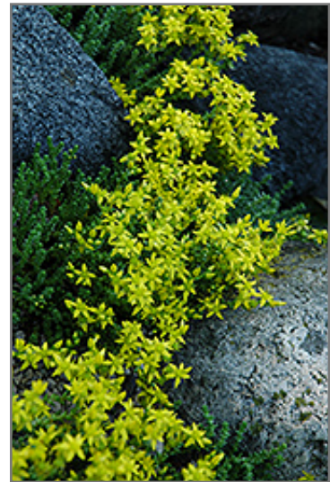
Six Row Stonecrop flowers