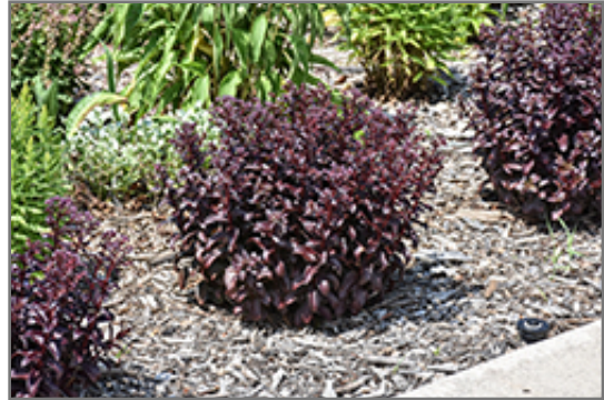
Dark Magic Stonecrop in bloom

Dark Magic Stonecrop will grow to be about 12 inches tall at maturity, with a spread of 20 inches. When grown in masses or used as a bedding plant, individual plants should be spaced approximately 16 inches apart. It grows at a fast rate, and under ideal conditions can be expected to live for approximately 15 years. As an herbaceous perennial, this plant will usually die back to the crown each winter, and will regrow from the base each spring. Be careful not to disturb the crown in late winter when it may not be readily seen!