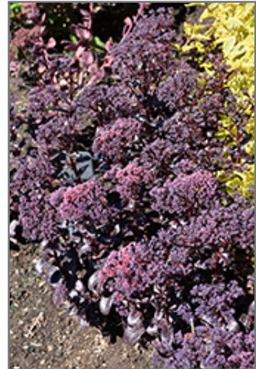
Dark Magic Stonecrop in bloom