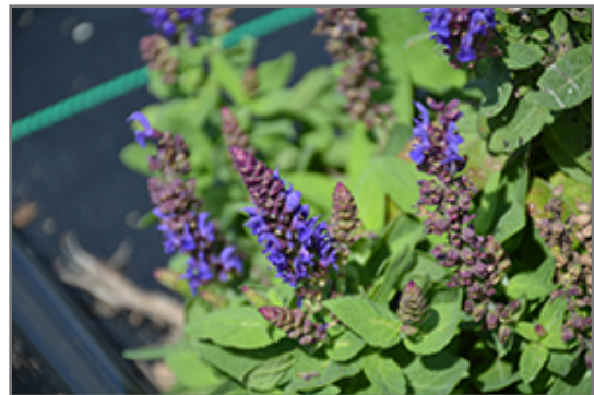
Swiftly Violet Blue Meadow Sage flowers