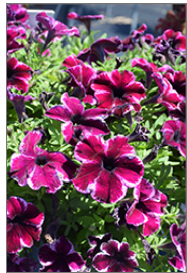
Crazytunia Cosmic Pink Petunia flowers