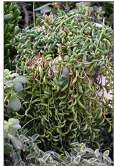
String of Bananas

When grown indoors, String of Bananas can be expected to grow to be only 6 inches tall at maturity, with a spread of 24 inches. It grows at a medium rate, and under ideal conditions can be expected to live for approximately 10 years. This houseplant will do well in a location that gets either direct or indirect sunlight, although it will usually require a more brightly-lit environment than what artificial indoor lighting alone can provide. It prefers dry to average moisture levels with very well-drained soil, and may die if left in standing water for any length of time. This plant should be watered when the surface of the soil gets dry, and will need watering approximately once each week. Be aware that your particular watering schedule may vary depending on its location in the room, the pot size, plant size and other conditions; if in doubt, ask one of our experts in the store for advice. It is not particular as to soil type or pH; an average potting soil should work just fine.