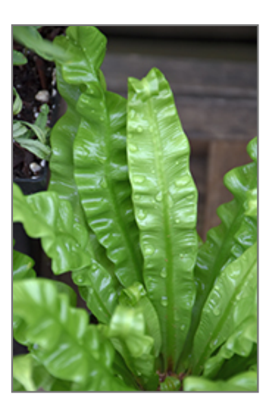
Crispy Wave Fern foliage

When grown indoors, Crispy Wave Fern can be expected to grow to be about 24 inches tall at maturity, with a spread of 18 inches. It grows at a slow rate, and under ideal conditions can be expected to live for approximately 15 years. This houseplant performs well in both bright or indirect sunlight and strong artificial light, and can therefore be situated in almost any well-lit room or location. It does best in average to evenly moist soil, but will not tolerate standing water. The surface of the soil shouldn't be allowed to dry out completely, and so you should expect to water this plant once and possibly even twice each week. Be aware that your particular watering schedule may vary depending on its location in the room, the pot size, plant size and other conditions; if in doubt, ask one of our experts in the store for advice. It is not particular as to soil pH, but grows best in rich soil. Contact the store for specific recommendations on pre-mixed potting soil for this plant.