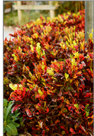
Mammy Croton foliage