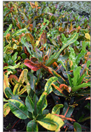
Mammy Croton in full

This is a dense herbaceous evergreen houseplant with an upright spreading habit of growth. Its wonderfully bold, coarse texture is quite ornamental and should be used to full effect. This plant should not require much pruning, except when necessary to keep it looking its best.