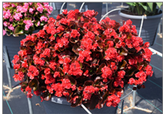
Double Up Red Begonia in bloom