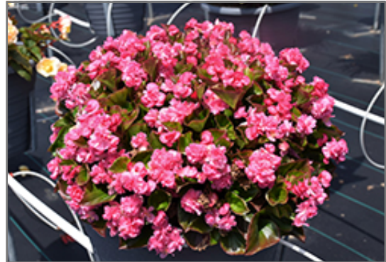
Double Up Pink Begonia in bloom