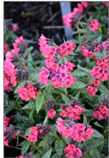
Shrimps On The Barbie Lungwort flowers

Shrimps On The Barbie Lungwort is recommended for the following landscape applications;