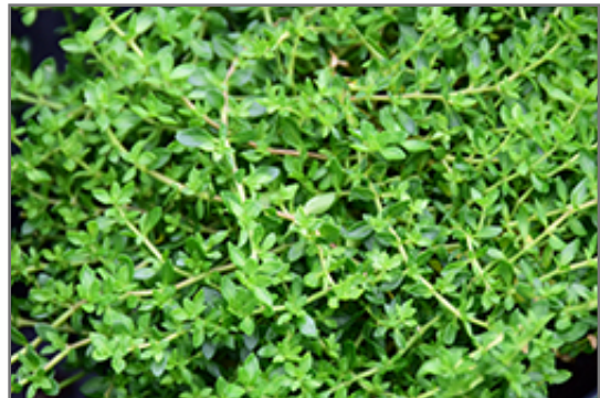
Rupturewort foliage

Rupturewort is recommended for the following landscape applications;