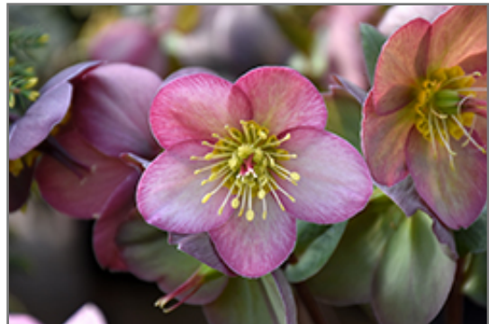
FrostKiss Cheryl's Shine Hellebore flowers

This is a relatively low maintenance plant, and should be cut back in late fall in preparation for winter. Deer don't particularly care for this plant and will usually leave it alone in favor of tastier treats. It has no significant negative characteristics.