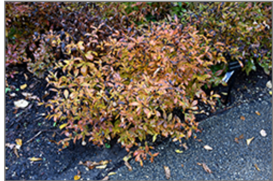
Bowman's Root in fall