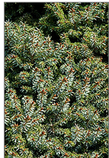
Dwarf Serbian Spruce foliage