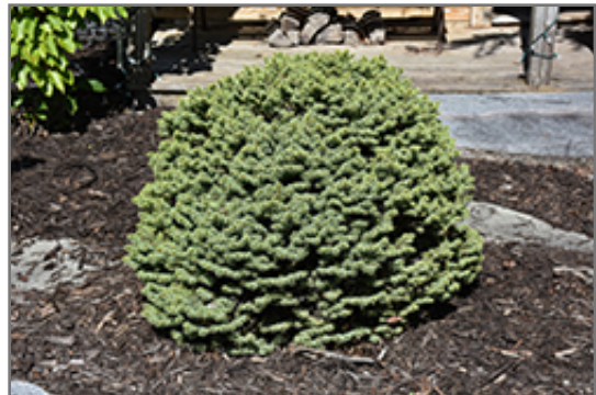
Dwarf Serbian Spruce