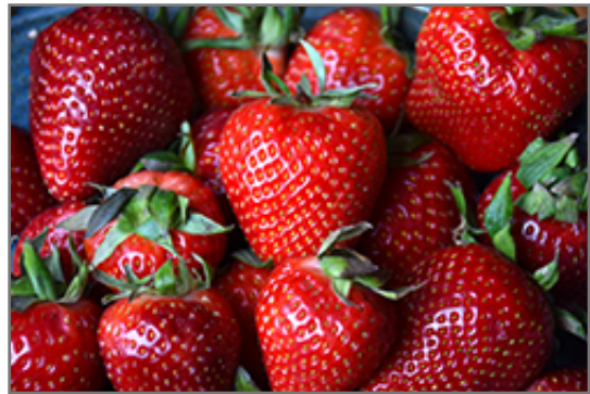
Albion Strawberry fruit