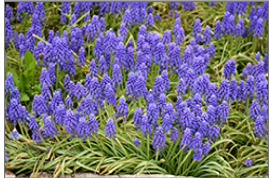
Grape Hyacinth in bloom