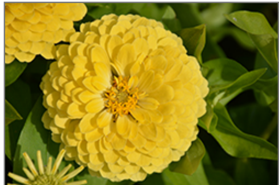
Preciosa Light Yellow Zinnia flowers

Preciosa Light Yellow Zinnia is recommended for the following landscape applications;