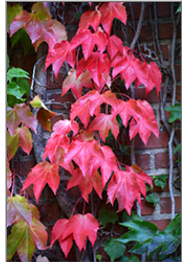
Boston Ivy in fall