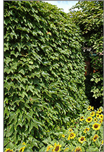
Boston Ivy

This woody vine does best in full sun to partial shade. It is very adaptable to both dry and moist locations, and should do just fine under average home landscape conditions. It is considered to be drought-tolerant, and thus makes an ideal choice for xeriscaping or the moisture-conserving landscape. It is not particular as to soil type or pH, and is able to handle environmental salt. It is highly tolerant of urban pollution and will even thrive in inner city environments. This species is not originally from North America.