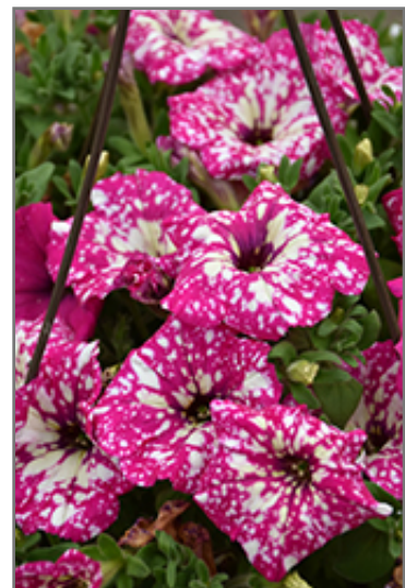
Headliner Pink Sky Petunia flowers