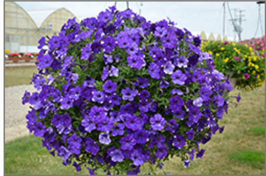
Headliner Night Sky Petunia in bloom

Headliner Night Sky Petunia will grow to be about 16 inches tall at maturity, with a spread of 30 inches. When grown in masses or used as a bedding plant, individual plants should be spaced approximately 24 inches apart. Its foliage tends to remain dense right to the ground, not requiring facer plants in front. This fast-growing annual will normally live for one full growing season, needing replacement the following year.