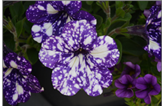
Headliner Night Sky Petunia flowers

Headliner Night Sky Petunia is recommended for the following landscape applications;