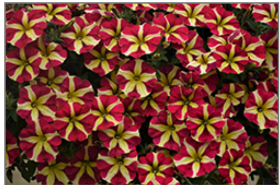
Amore Queen of Hearts Petunia flowers