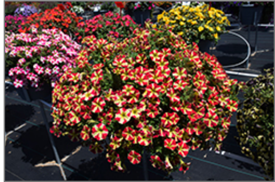
Amore Queen of Hearts Petunia in bloom

Amore Queen of Hearts Petunia will grow to be about 12 inches tall at maturity, with a spread of 14 inches. When grown in masses or used as a bedding plant, individual plants should be spaced approximately 10 inches apart. Its foliage tends to remain dense right to the ground, not requiring facer plants in front. This fast-growing annual will normally live for one full growing season, needing replacement the following year.